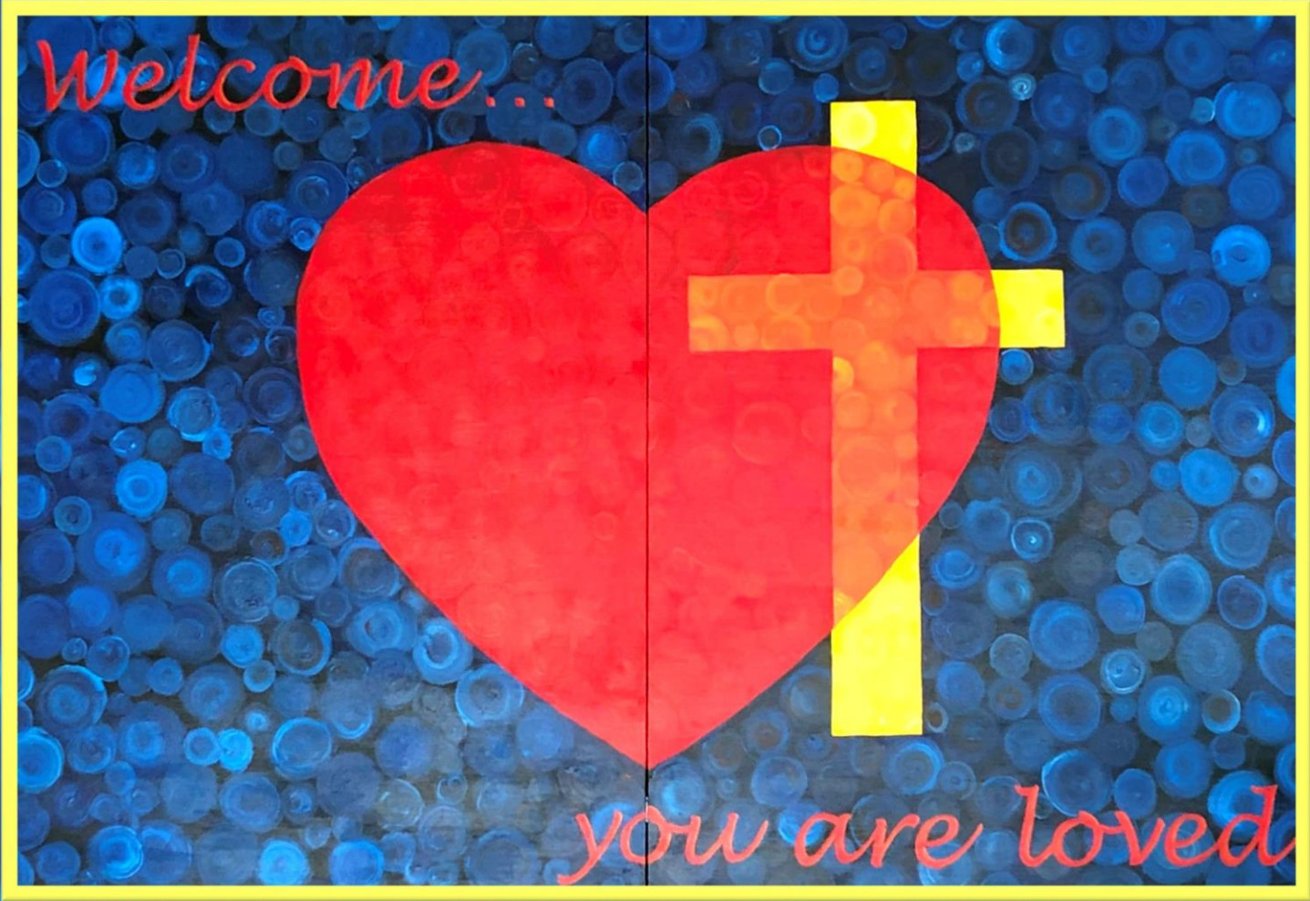
Banner made by Saint John the Baptist Elementary School Class of 2019